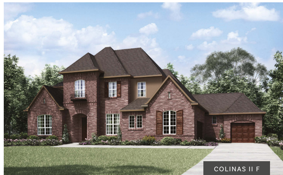
COLINAS II F

Illustrations show optional items and materials that vary based on availability and community requirements.