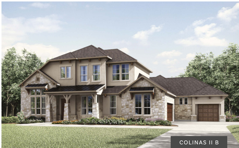
COLINAS II B