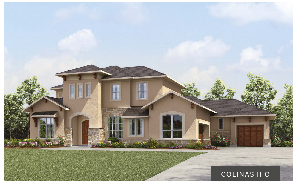
COLINAS II C