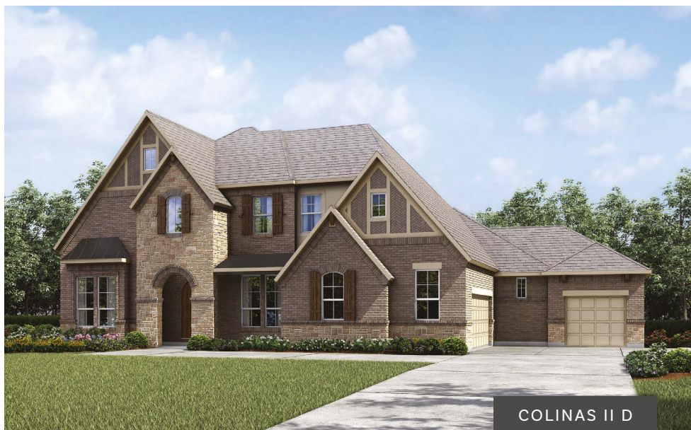
COLINAS II D