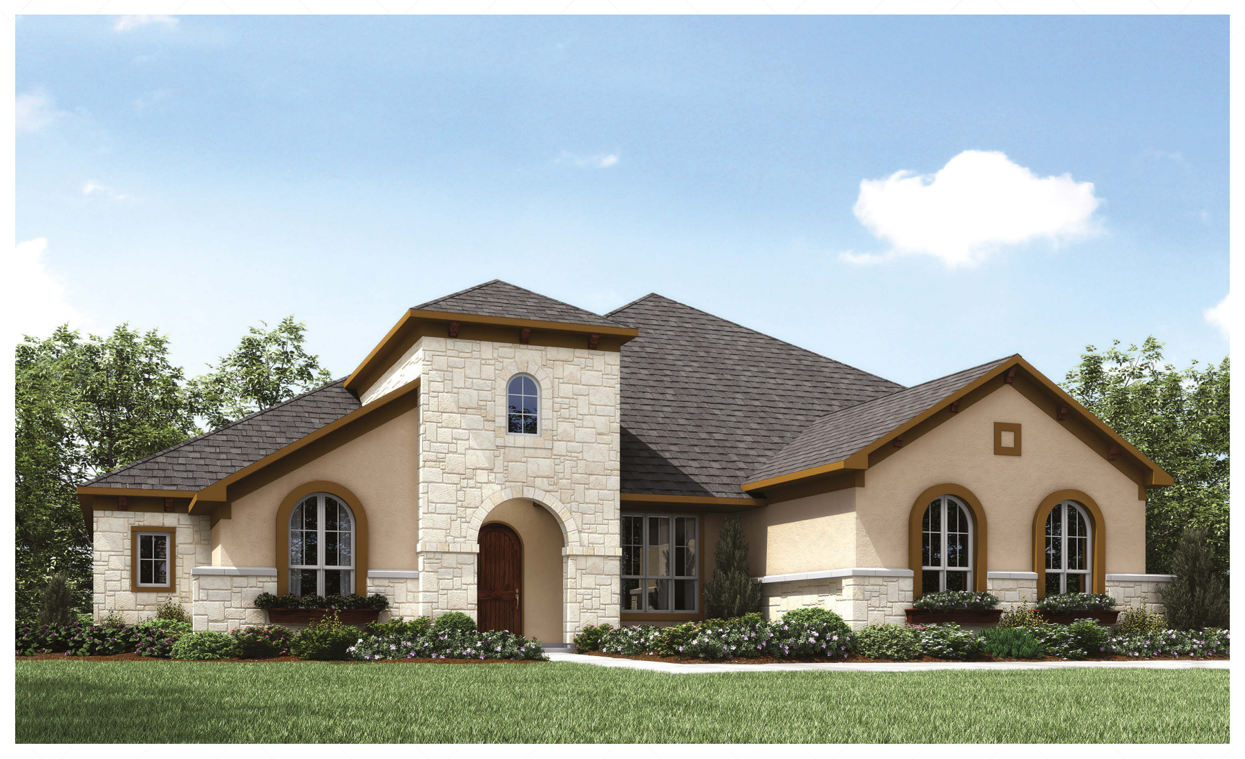
The elevations and floor plans in this brochure show optional items.