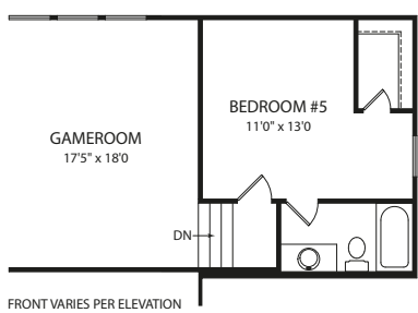
Optional Bedroom #5